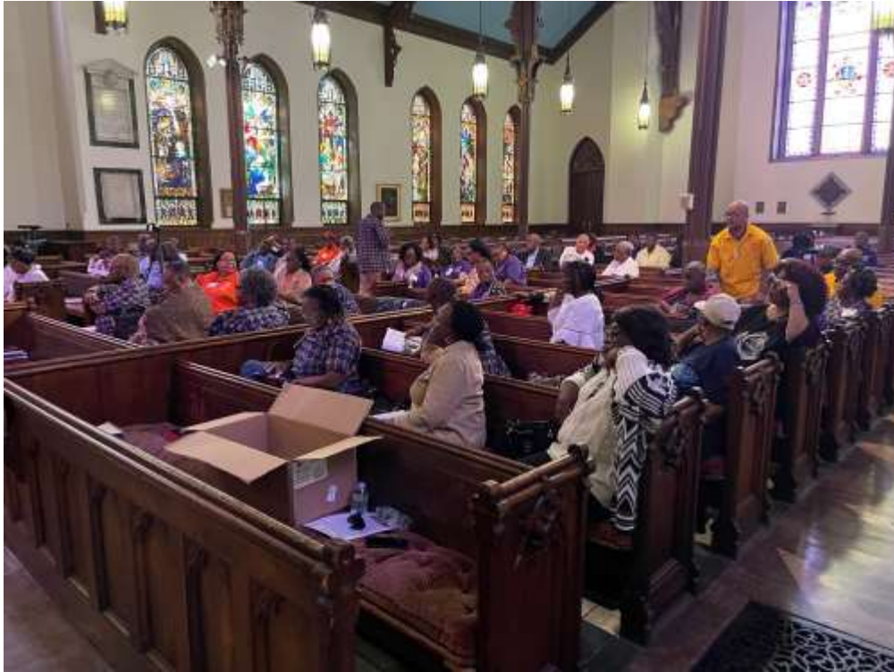
A well-deserved rest!