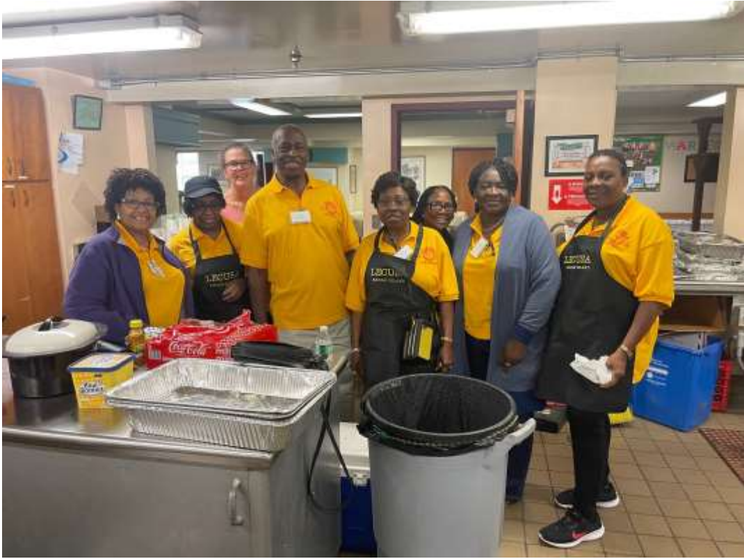
Saturday Business Meeting