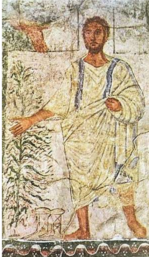
Moses and the burning bush. 3rd century CE

Wednesday Noonday Prayer and Faith Inquirers Discussion will resume Wednesday, April 27th. After reading Jon Meacham's book during Lent, we return to scripture. For next Wednesday, we will discuss Chapters 1-4 in the Book of Exodus. All are welcome to participate.