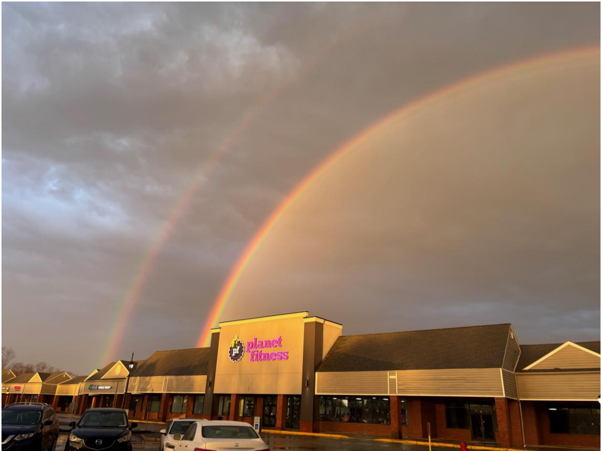
on Maundy Thursday

Grant, O God, that your holy and life-giving Spirit may so move every human heart, that barriers which divide us may crumble, suspicions disappear, and hatreds cease; that our divisions being healed, we may live in justice and peace; through Jesus Christ our Lord.