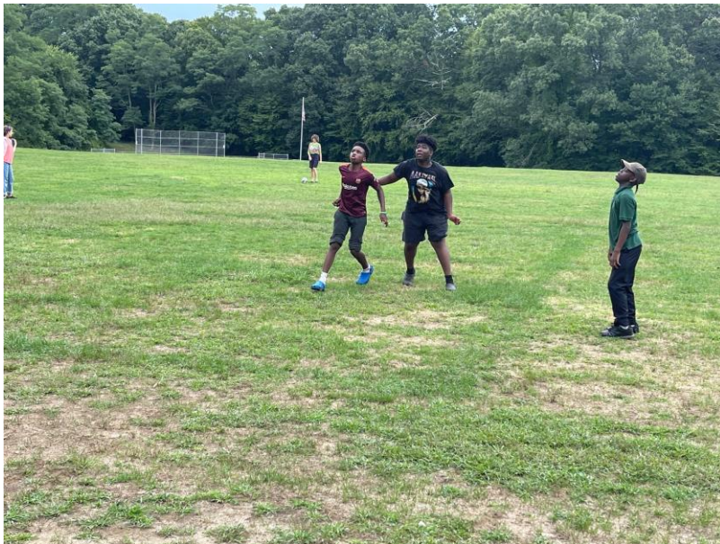
Football and soccer fun at last year's picnic

Look for sign-up sheets in Rose Hall and let us know what food or beverage you wish to bring. More details to follow.