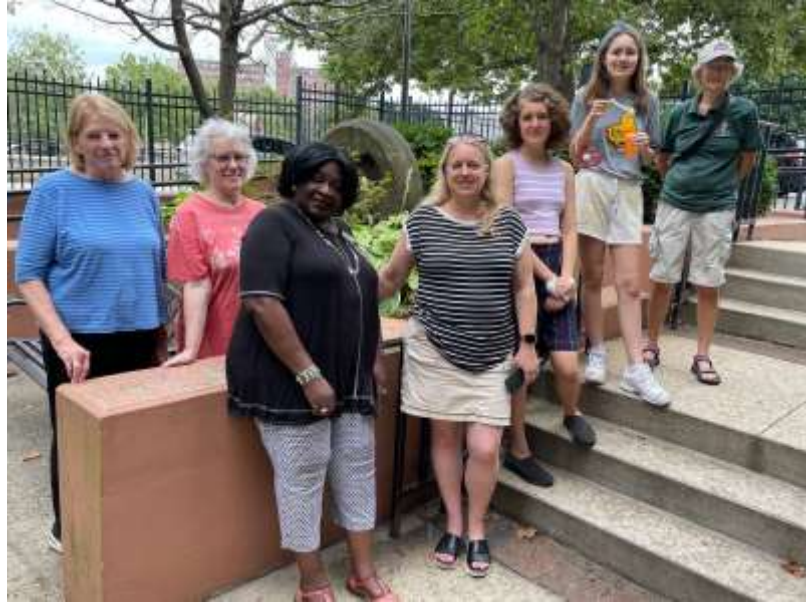
Waiting on Westminster St. to greet the campers.