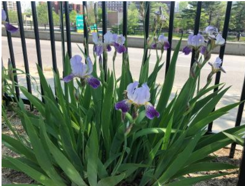
Altar Flower Ministry

at: https://us02web.zoom.us/j/84955593827?pwd=akNZeTlmSCtTb1BoUU9hcWQrZk5xZz09