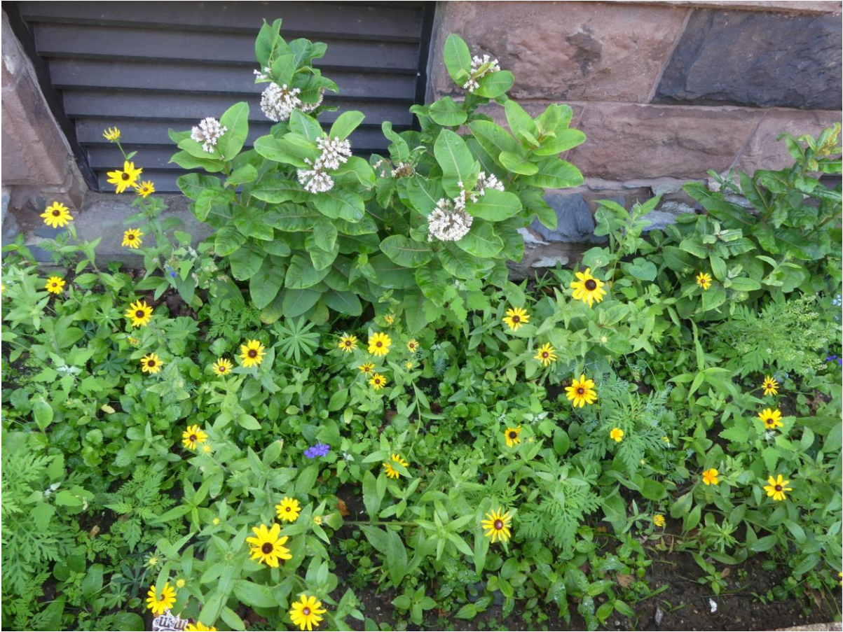
Photo of the church window well