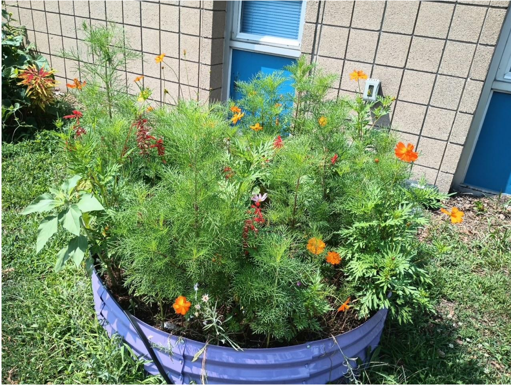
West End Community Center