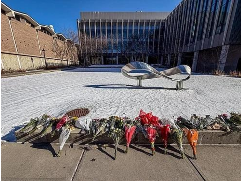
Memorial Flowers at Brown's Engineering Research Center