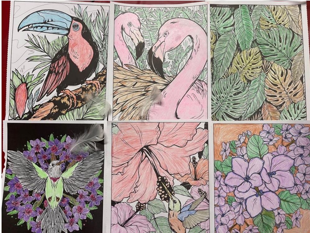
Meditative artwork from the Advent Retreat