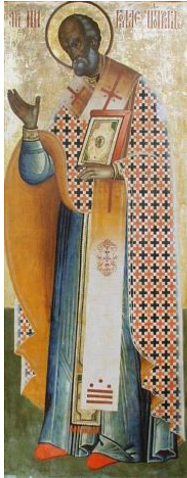
Russian Icon of St. Nicholas

Other Christmas traditions evolved over time from different European countries. The Dutch Sinterklaas tradition grew around St. Nicholas of Myra (December 6 th ) while Father Christmas came from English tradition. The Christmas tree tradition comes to us from Germany.