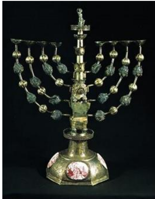
Hanukkah Menorah 18th Century