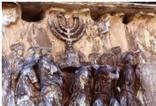
First century Arch of Titus, Rome

Book 1 of Maccabees records the Second Temple was plundered by Greek ruler Antiochus IV in 169 BCE. When Judas Maccabeus defeated the Greeks, he had a new seven-branched menorah made. The menorah had only enough oil to burn one night, but it miraculously lasted eight nights, so they could work 24/7 restoring the Second Temple. They established the Festival of Dedication ( hanukkah in Hebrew) of the altar and the eight nights the lamp burned.