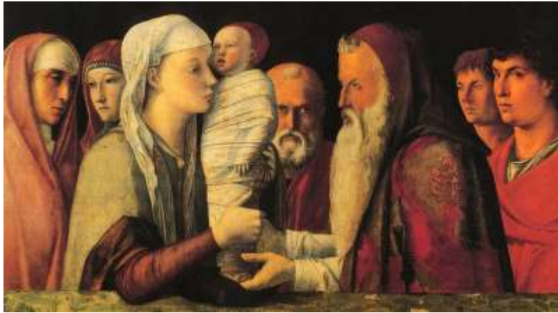
Presentation of Jesus in the Temple by Giovanni Bellini

May we meet and recognize Christ the Light in whatever we are doing this day.