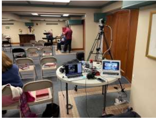
Ryan's broadcasting set-up