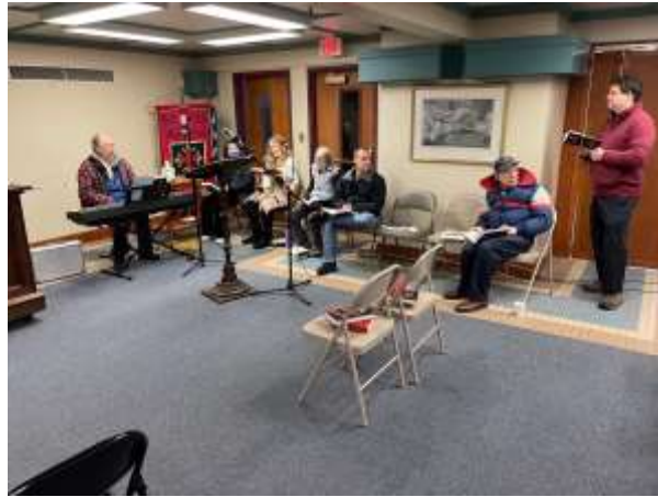
Choir warm-up in the cold