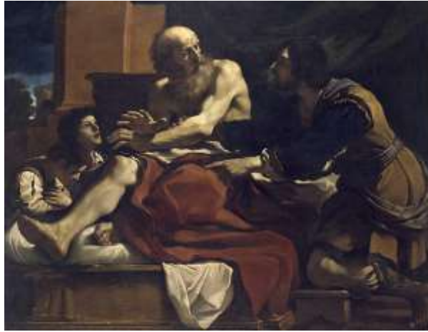
Jacob, Ephraim, and Manassah (Guercino, 17th Century)

We are finishing the Book of Genesis this Wednesday (Chapters 48-50)! All are welcome in-person or via Zoom: