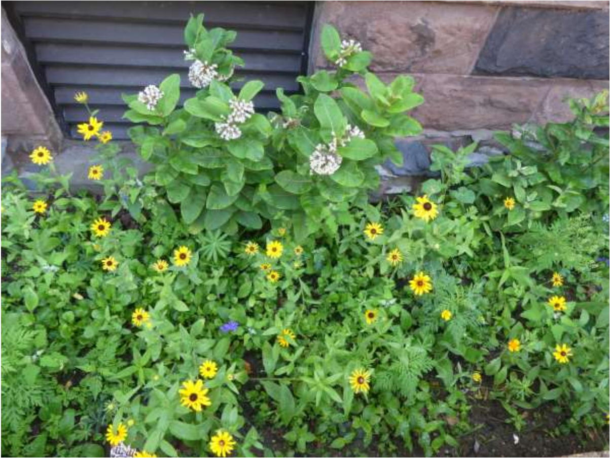
Photo of the church window well last week