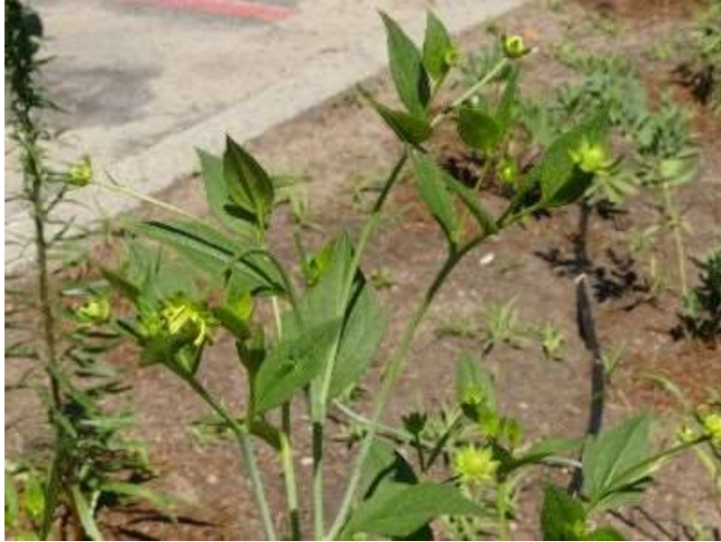
Yellow Coneflower on July 4th