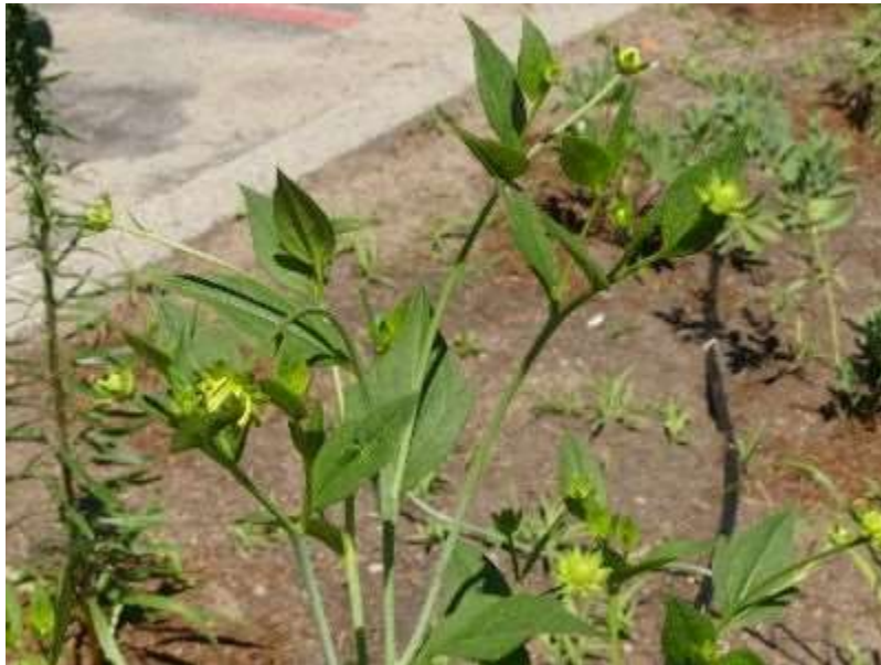
Yellow Coneflower on July 4th

The next major portion of the project will take place in September, with the creation of rain gardens in the side yard and additional pollinator gardens along the church building and in the upper courtyard garden. We are planning to have a small vegetable garden along the south side of the church next season, so if you are interested in helping with that, please see Becky or Deirdre.