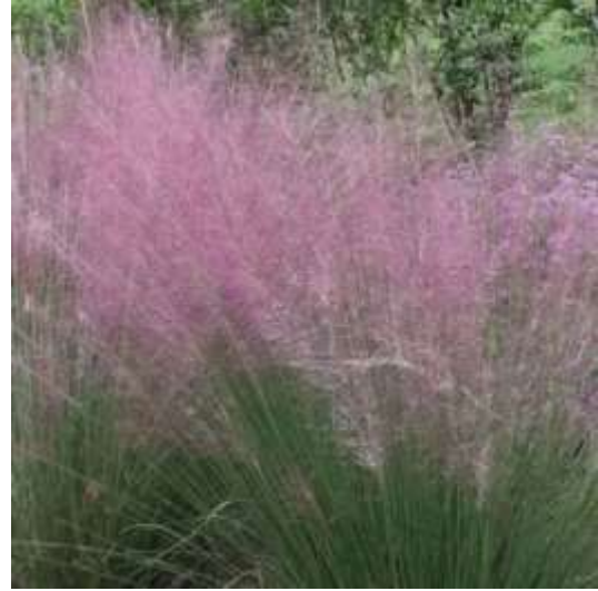
Purple Love Grass Late Summer/Early Fall