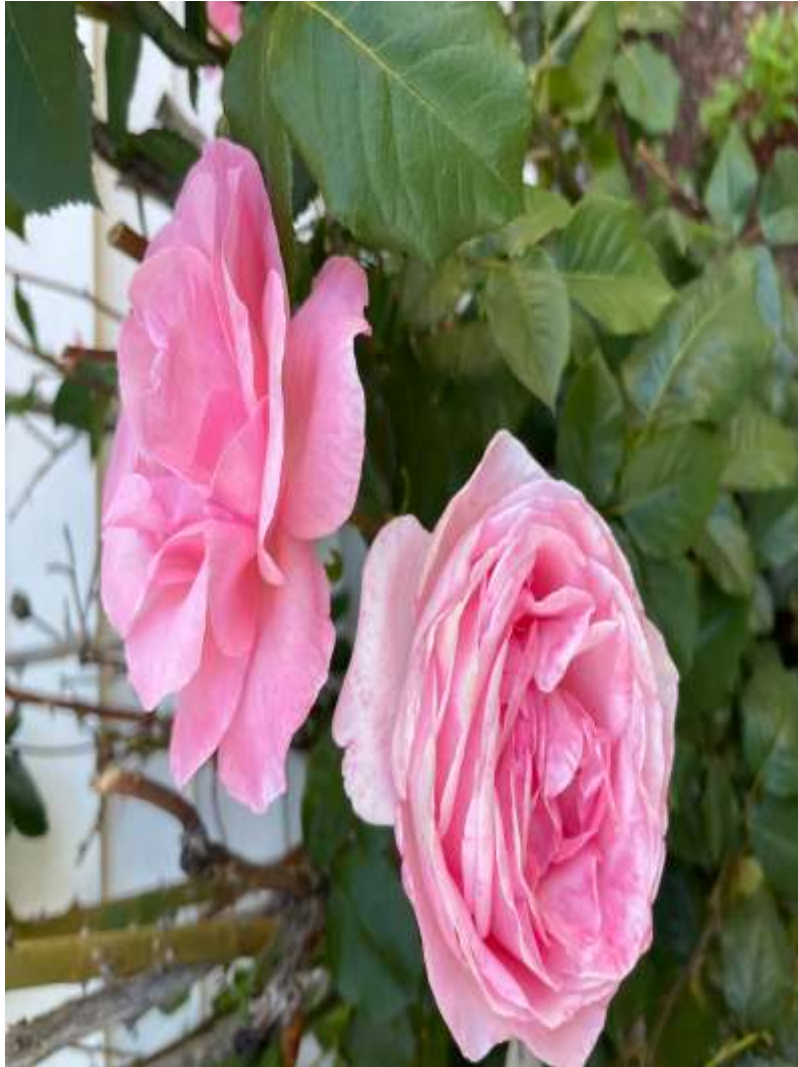
For the Beauty of the Earth, photo from Barbara's Garden