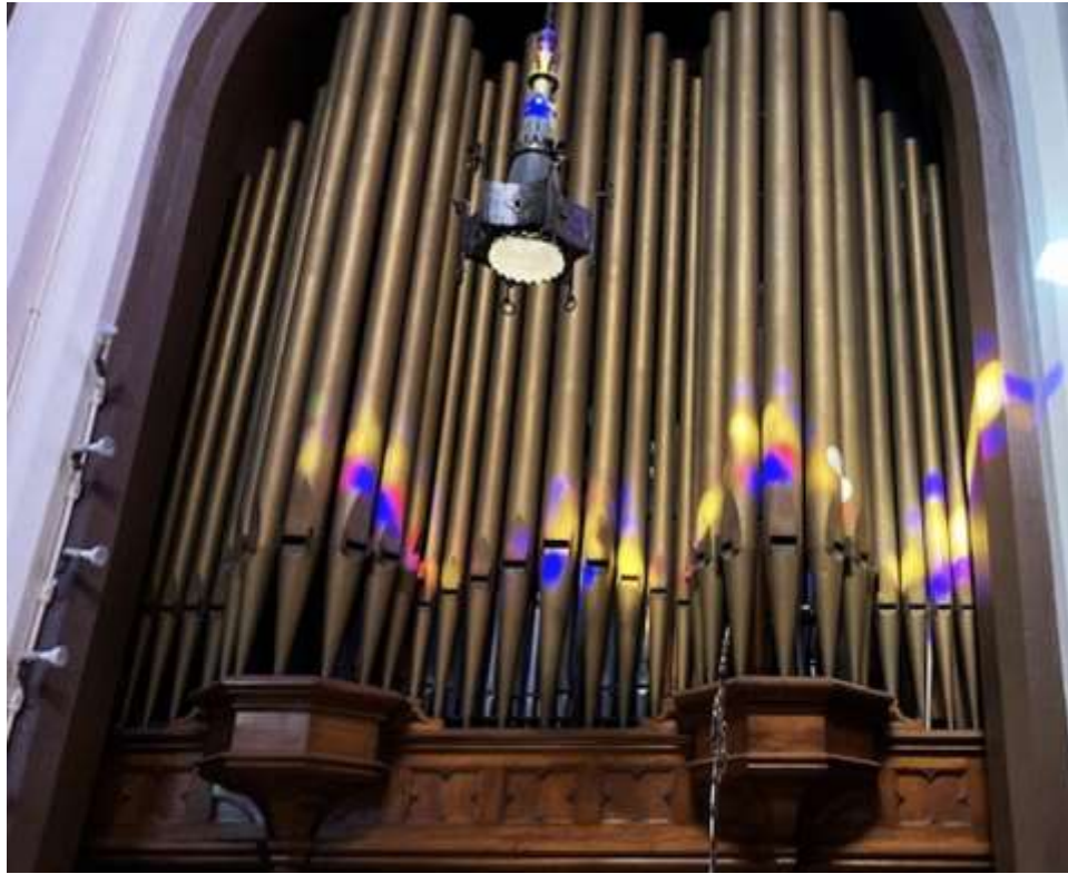
Easter morning sun shining on the organ pipes