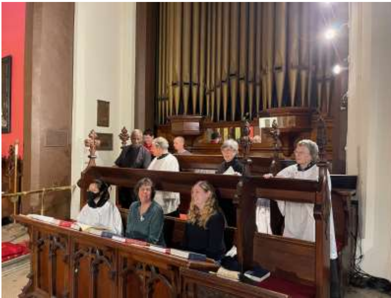
All Saints' Choir

We are hoping for full participation. Your voice is so important! Thank you for your feedback.