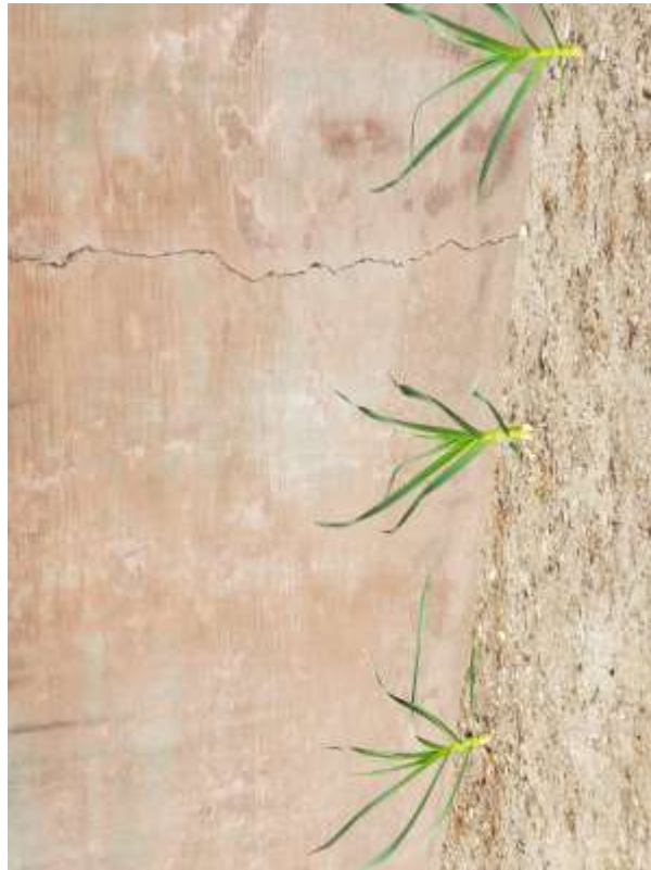
Garlic planted in September

Almighty God, in giving us dominion over things on earth, you made us fellow workers in your creation: Give us wisdom and reverence so to use the resources of nature, that no one may suffer from our abuse of them, and that generations yet to come may continue to praise you for your