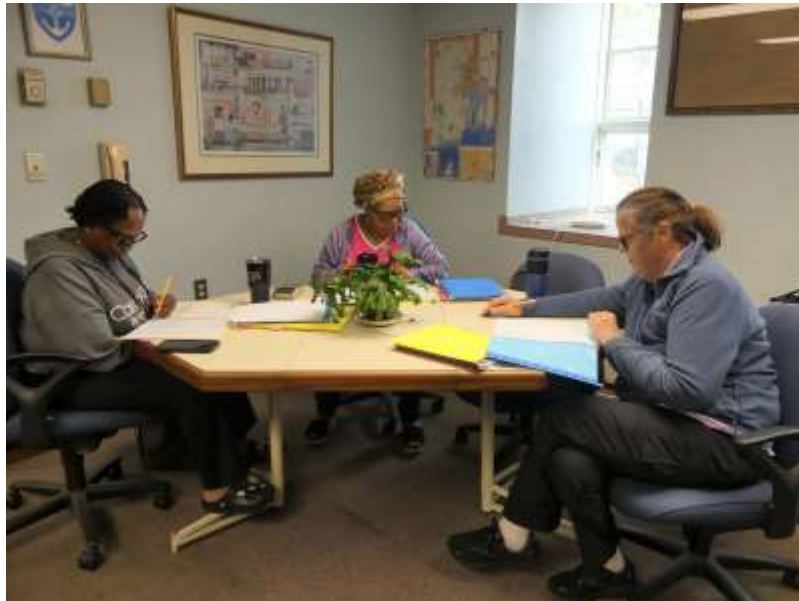
Audit Team Last Saturday Hard at Work