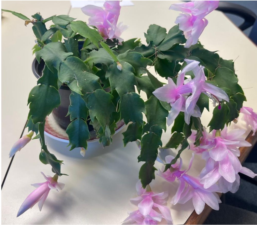
Office cactus blooming once again just in time for Advent