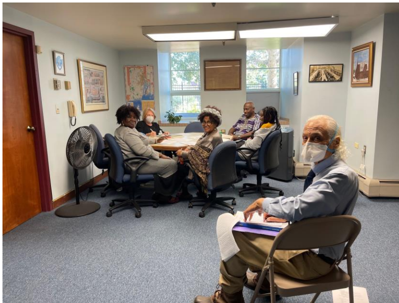
Outreach meeting on October 8