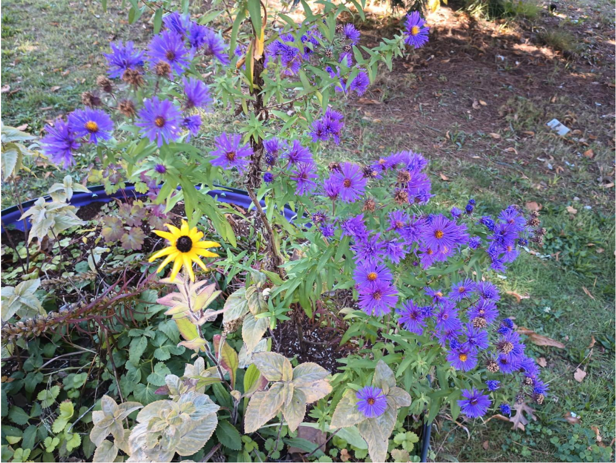
West End Community Center Garden Initiative