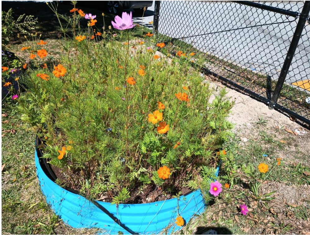
West End Community Center Gardening Project