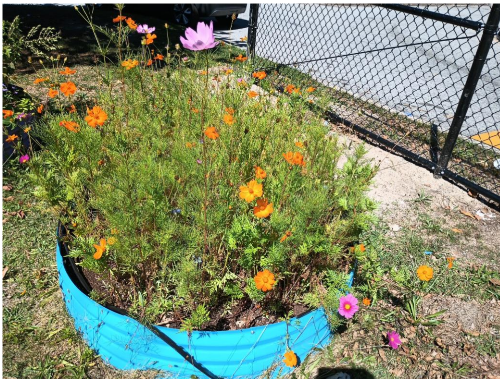
West End Community Center Gardening Project