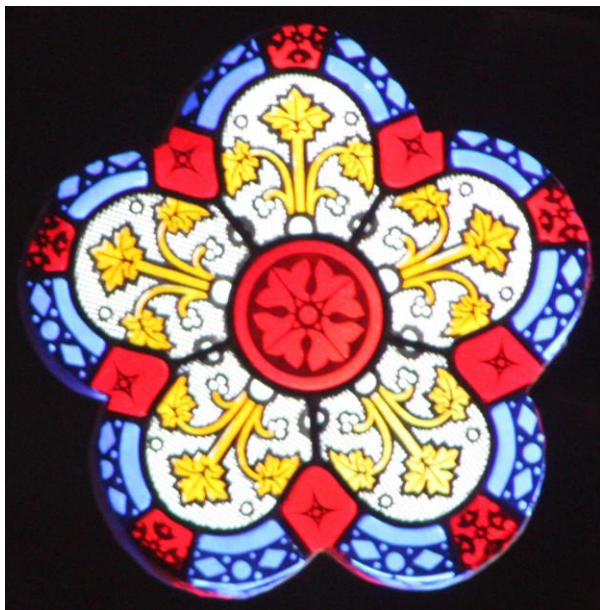
Monday Meditations and Music

Almighty and everlasting God from whom comes every good and perfect gift; give them the healthful Spirit of your grace; and that they may truly please you, pour upon them the continual dew of your blessing. Grant this O Lord, for the honor of our Advocate and Mediator, Jesus Christ. Amen. (BCP p. 817)